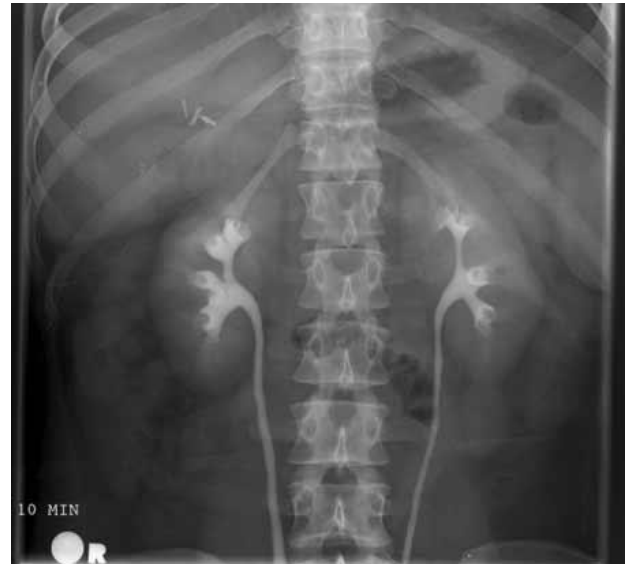
An x-ray image of the upper abdomen 10 minutes after the injection of contrast material shows normal kidneys, collecting systems and upper ureters.

IVP studies are not usually indicated for pregnant women.