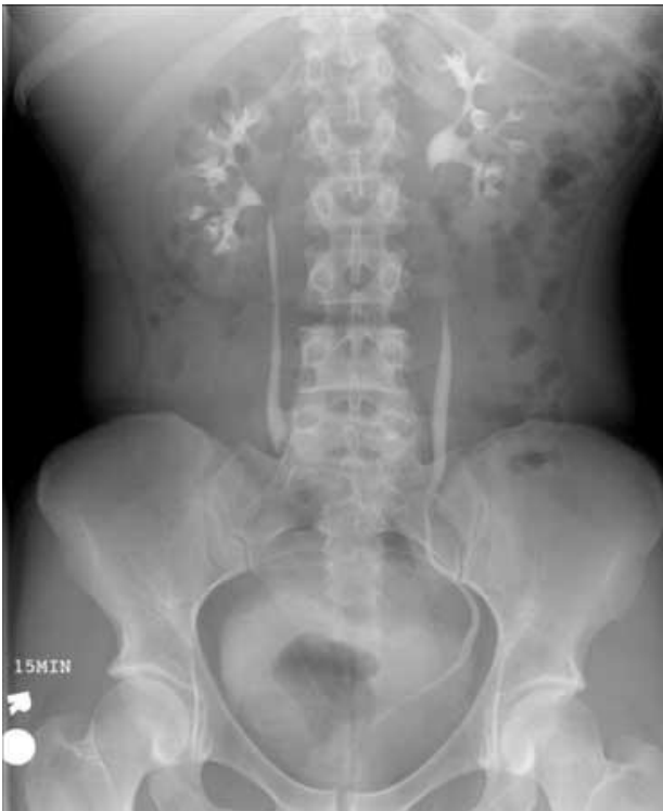
An x-ray image of the whole abdomen taken 15 minutes after injection of contrast material shows further excretion into the lower ureters and bladder.