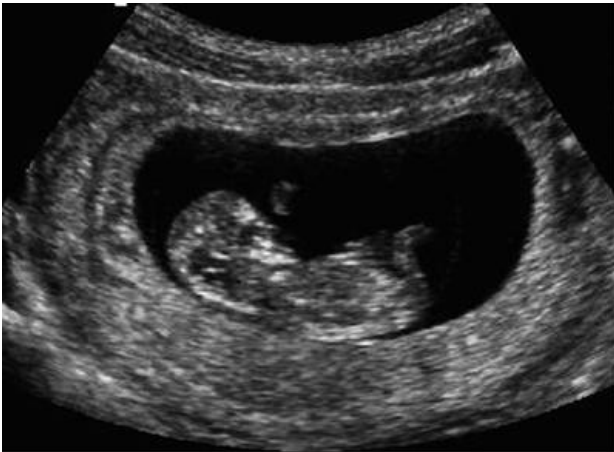
Sample image: Fetal profile 1st trimester